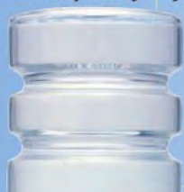
Product Code KCRYC

1-15/16" (49 mm) Diameter x 2-1/16" (52 mm) Stand-off from Door Surface