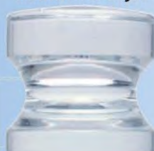
Product Code KCRYT

1-15/16" (49 mm) Diameter x 1-13/16" (46 mm) Stand-off from Door Surface