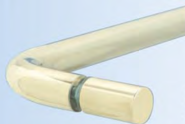
Standard Knob shown attached to a Single Mount Towel Bar