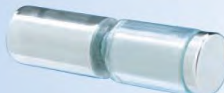
Product Code KCBTB Back-to-Back Set