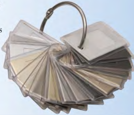
Product Code SAMPLE-RING

Available finishes are neatly displayed on this Sample Ring. Show your customers the latest in modern finishes to match any décor.